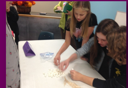
F.A.S.T. 4-H Club teen leadership class learning about teamwork through tower building using only toothpicks and marshmallows

University health and education students were certified in mentorship and administering extensive pediatric cardiovascular risk assessment profile including a lipid panel, blood pressure, biometrics and evaluation . The university students used pre/post surveys for evaluation measures, delivered six academic service learning lessons, which coincided with each lesson to caregivers of the fifth grade students in Houghton, Marquette, and Chippewa counties. Each health lesson uses online goal setting, tracking and mentorship by the team of trained university students.