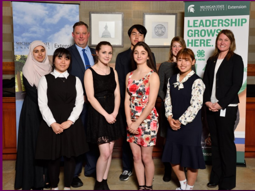
2018 Capitol Experience U.P. Delegation.